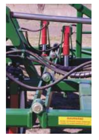
Heavy Duty Depth Wheel Assembly